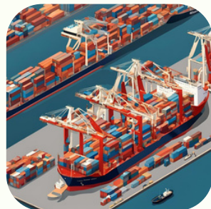
Sea Freight Forwarding