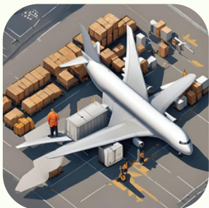
Air Freight Forwarding