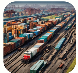
Rail Freight Forwarding