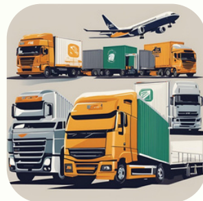
Road Freight Forwarding